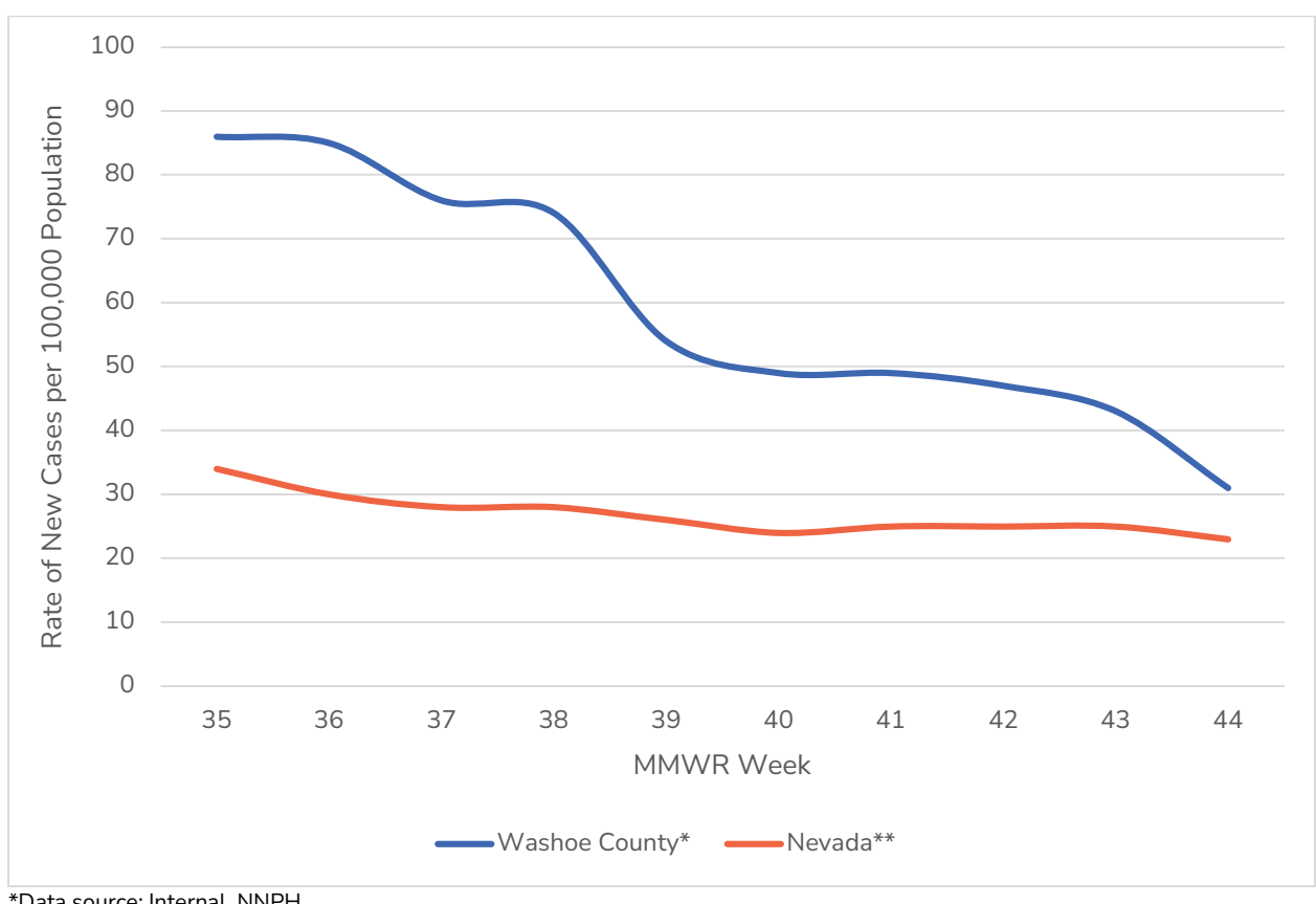
Figure 1. Rate of New Cases Reported by MMWR Week, Washoe County and Nevada, 2023